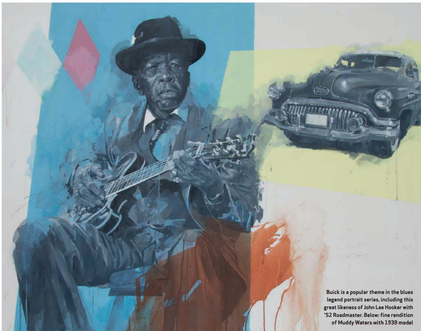
Buick is a popular theme in the blues legend portrait series, including this great likeness of John Lee Hooker with '52 Roadmaster. Below: fine rendition of Muddy Waters with 1939 model